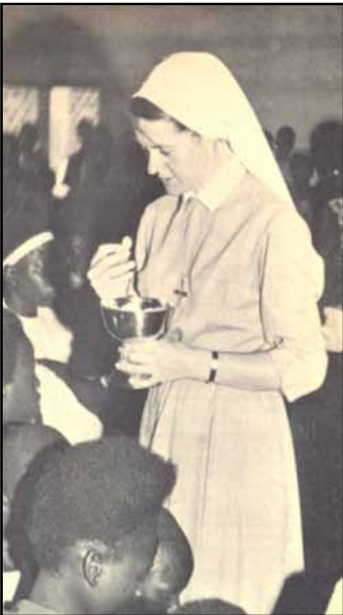
What a shame!

ent: some priests preach about politics, others about sports, others about the last financial news. Some give Communion standing up, others in the hand and others in both species. There is nothing universal about all of this.