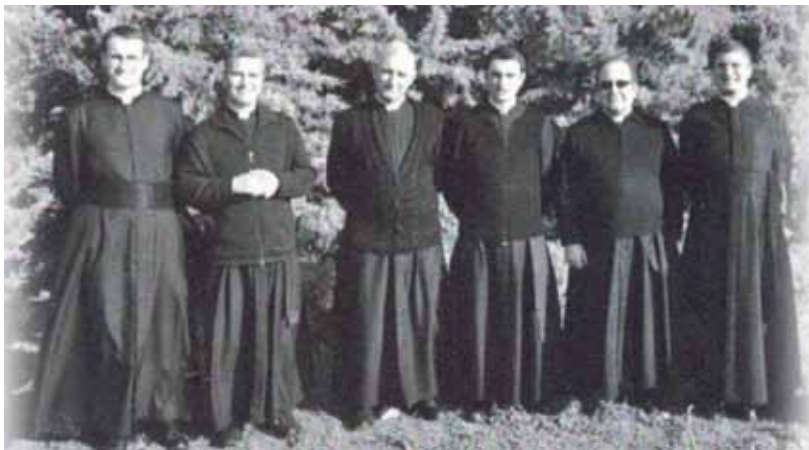
These are priests!

not give good fruit, and that by their fruits we shall know them, what can be said of the “fruits” of