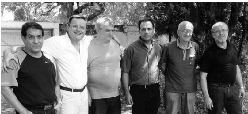
Are these priests?

We can say that these fruits do not pertain to our Holy Catholic Church which is good in every