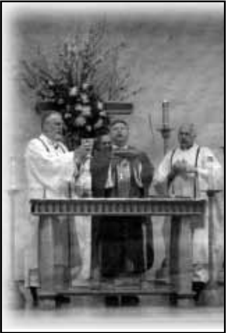
What?... a Mass?

cannot give bad fruits. So then, all the changes which have taken place in the last four decades have nothing to do with the sanctity of the Catholic Church, and those people who proclaim that the Novus Ordo Mass, the liturgical disorders and the scandalous behavior of the priests who dress up like clowns or like Superman to celebrate “Mass” are not true members of the Church of Christ.