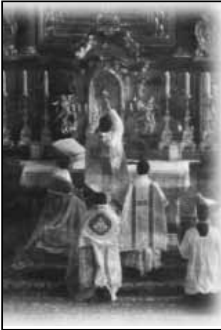
What a Mass!