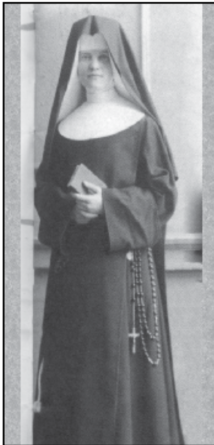
What a nun!

And we who assist at the Latin Tridentine Mass of all times, celebrated identically in every traditional church throughout the entire world, are considered rebels of another sect!